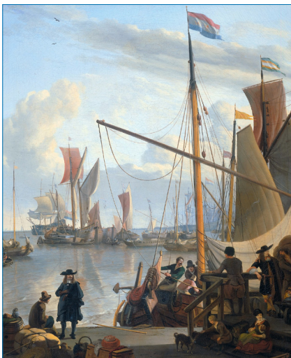
View from the Mussel Pier in Amsterdam by Ludolf Bakhuizen, 1673