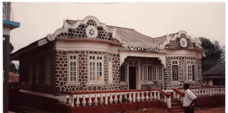
Ikem Okoye with an example of southern Nigerian architecture.