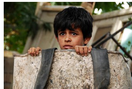
Images from Global April, L to R: Scene from Jafar Panahi’s “Taxi”; Scene from “Land of Hope”; Scene from Majid Majidi’s “The Song of Sparrows”