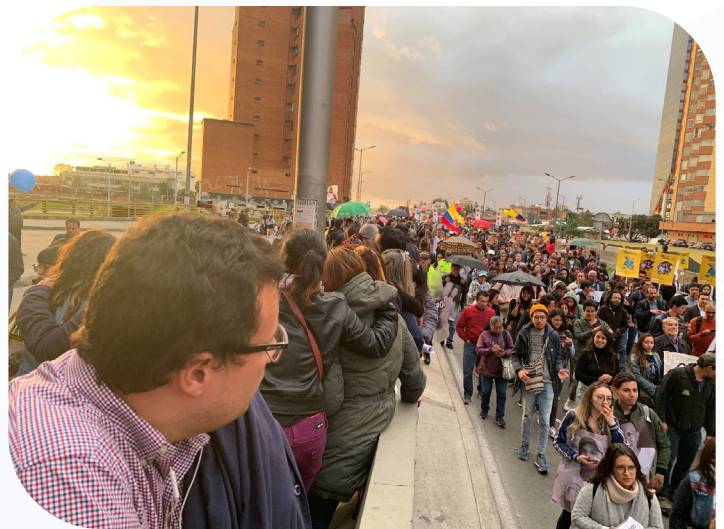
La Marcha por la Vida rally in Colombia in July 2019

the challenges that Colombian democracy faces after the end of the commodity boom. My research trip to Colombia was part of a larger project on sources of political dissatisfaction in countries that are seen as “success stories” in Latin America: Chile (visited June 2019) and Peru. In addition to consulting libraries and conducting interviews, I was able to attend one of the most significant rallies in Colombia in recent years, La Marcha por la Vida (Rally for Life), held in all major cities on July 26, 2019. This rally was convoked by civil society organizations demanding that the state better protect the life of social activists and an end of all politically-motivated violence in Colombia. I’m glad to report that my book manuscript, entitled A Dynamic Theory of Populism in Power: The Andes in Comparative Perspective , is now completed and will be published by Oxford University Press in 2021.