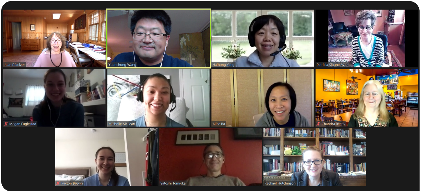
Asian Studies faculty meet via Zoom

research projects with interested students and the public. Though each lasted for only 50 minutes, the speakers engaged their audience with research topics varying from Mongolian folk songs, Southeast Asian power relations to ceramic technologies in China, and Japanese video games among others.