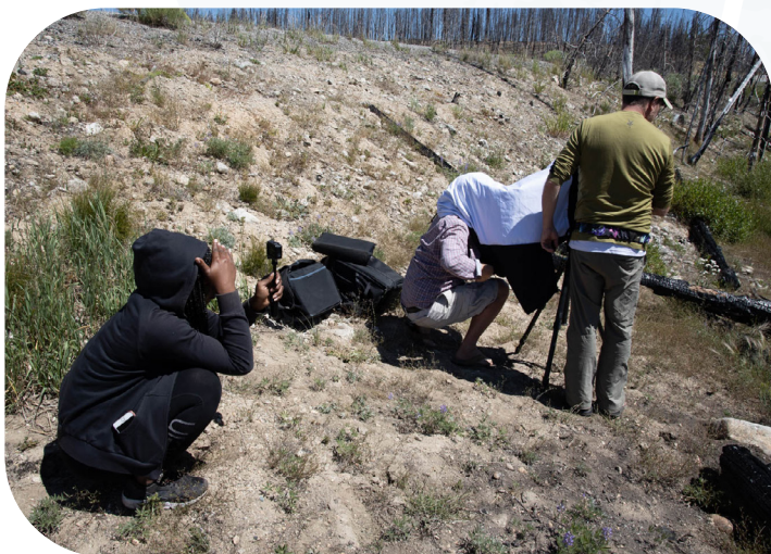
Behind the Scenes; Photo courtesy of the ARRIVALS Project

Although the team has dispersed, things are just getting started on Arrivals . The photographs taken in Idaho are being processed and