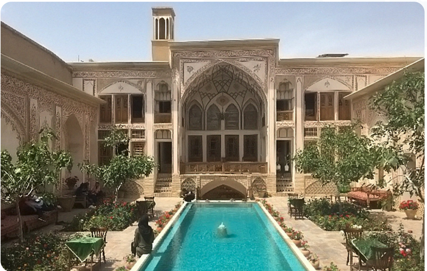
Borujerdi House in Kashan, Iran.