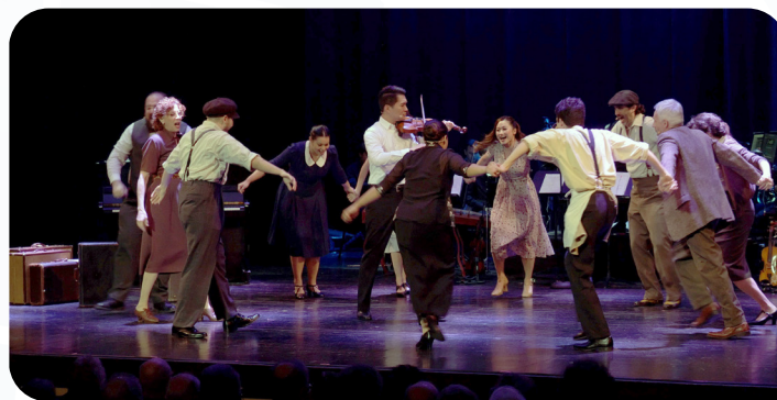
Shanghai Sonatas had its world premiere at UD in February 2020